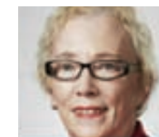
THE HON. SUSAN E. GREER Retired Judge, Ontario Superior Court of Justice